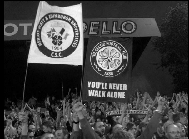
HWEUCSC at the Millerntor last year.

Promotion to Bundesliga 2 after a decade